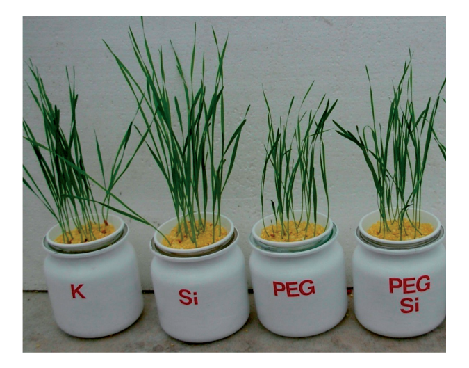
Fig. 2. The influence of severe drought stress (15% PEG) and silicic acid (1.5 mM H_4SiO_4 ) on 10-day old wheat seedlings (K – Control).