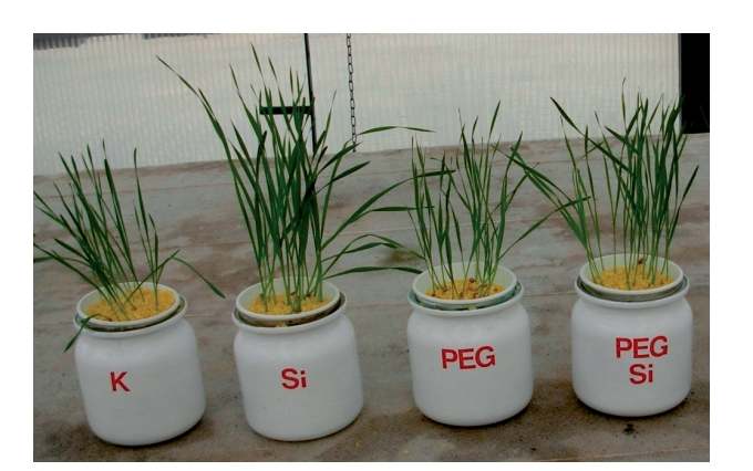
Fig. 1. The influence of mild drought stress (10% PEG) and silicic acid (1.0 mM H_4SiO_4 ) on 10-day old wheat seedlings (K – Control).

The experiments were conducted in the greenhouse of Institute of Soil Science and Plant Cultivation in Wroclaw (Poland), in 2018. Plants were cultivated in the hydroponic cultures in nutrient solution containing (mM): 3 Ca(NO<sub>3</sub>)<sub>2</sub> 4 H<sub>2</sub>O, 2 KNO<sub>3</sub>, 1 MgSO<sub>4</sub> 7 H<sub>2</sub>O, 1 KH<sub>2</sub>PO<sub>4</sub>, 0,2 Fe-EDTA and microelements. The pH of the solution was adjusted to 6.0. After germination, eighteen uniform germinated grains of spring wheat ( Triticum aestivum L.) were transferred into hydroponics and were grown for 10 days. The experiment was carried out at the temperature range of 15-25°C, and humidity 60-70%. Drought stress was induced by polyethylene glycol (PEG 6000) added to the nutrient solution. Silicon applied in the form of silicic acid was dissolved in water and placed in a ultrasonic bath for 2 hours to obtain stable colloidal system.